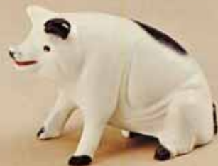
23-060 Pig Bank 4 1/4"