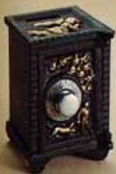
23-250 Safe Bank 4"