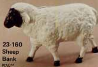
23-160 Sheep Bank 5 1/2"